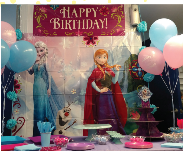
Party room example